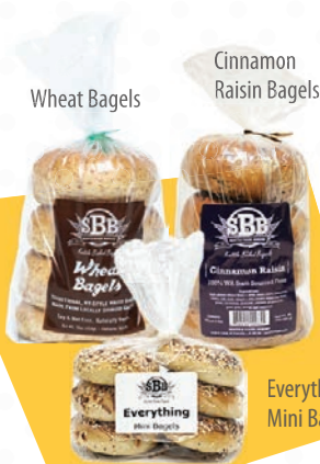
Everything Mini Bagels